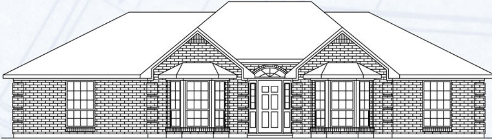
B - 2121 sq.ft. 59' - 7" W x 48' - 7.5" D