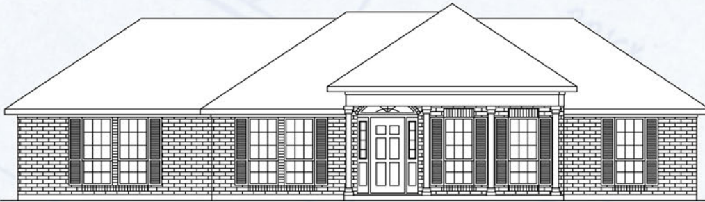
C - 2113 sq.ft. 59' - 7" W x 52' - 2" D