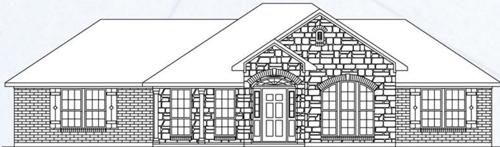
D - 2102 sq.ft. 59' - 7" W x 53' - 1.5" D

VA, FHA, USDA and Conventional Financing